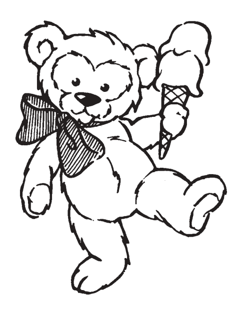
at the Elmhurst Public Library